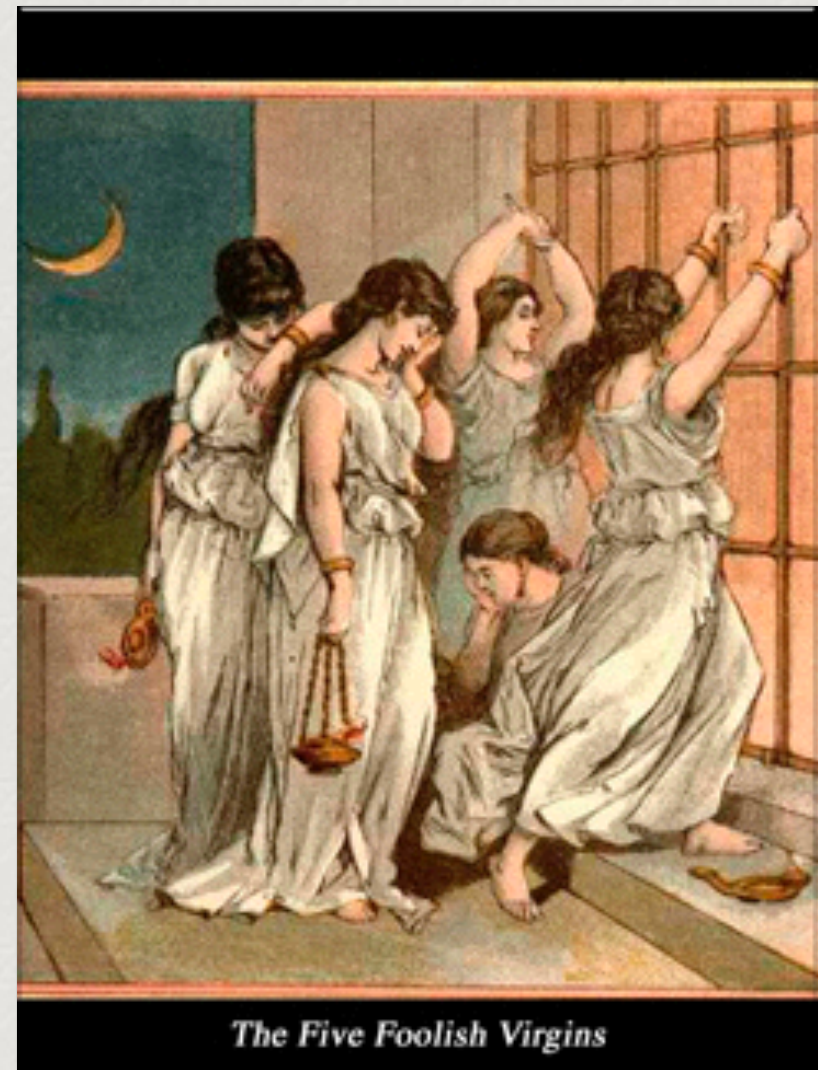
The Five Foolish Virgins